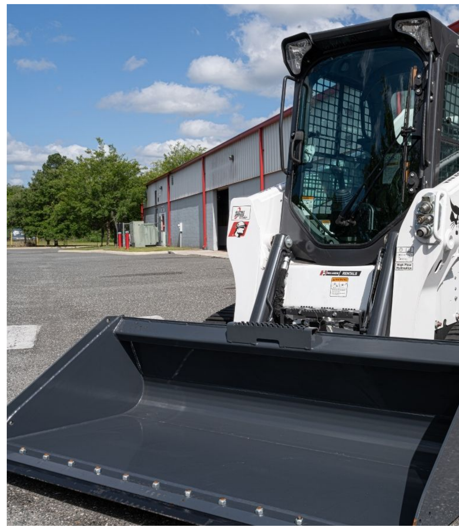
Rubber tracks are some of the most important components of your track loader. They will impact the smoothness of your ride, which environments your compact track loader (CTL) can operate in, the lifespan of